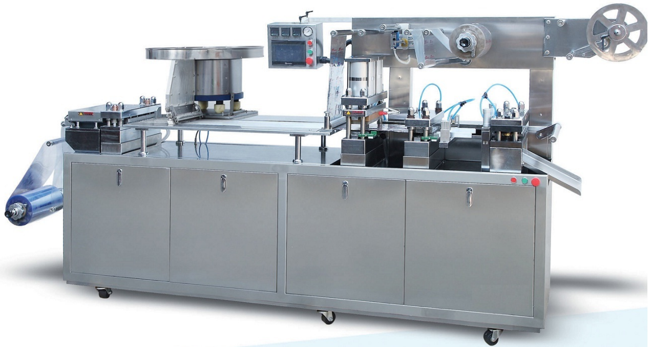
DPP-250, 260 (with vibrating feeder)